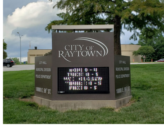
City Monument Sign