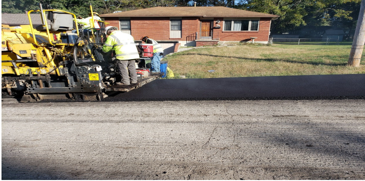
Asphalt Overlay Project