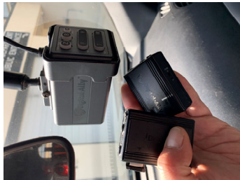
EVO HD In-Car Camera