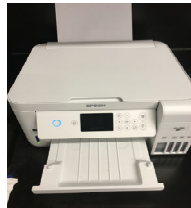
Epson Eco-tank Printer