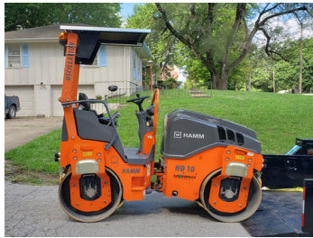
Dual Drum Roller Compactor