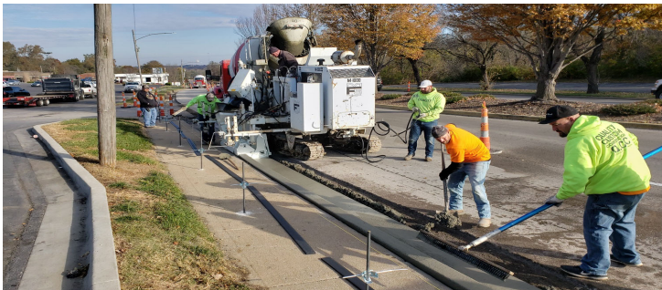
Raytown Trafficway Curb Replacement