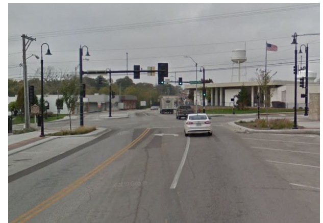
Pavement Marking Project