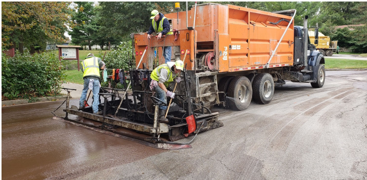
Roadway Micro-Surfacing Project